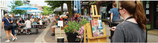
Downtown Housing Tour

In May, the downtown Housing Tour returned after three years. It was an open-house event that gave prospective residents the opportunity to view homes and experience the benefits of downtown living. On August 5 we also sponsor Art in the City, where artists and aspiring artists showcase their work.