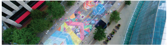
Art in the City